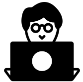
Video Production Engineers (n = 6)

"I always need to segment a provided lecture slide into multiple slides with less information in them and that is a very tedious task." (P1).